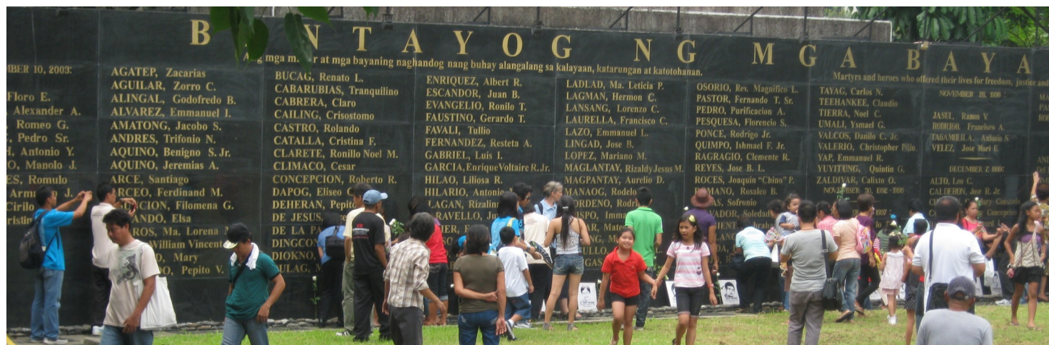
Remembering our heroes. Families and relatives of the desaparecidos from the Philippines offered flowers in remembering the stolen lives of their loved ones. Prior to the offering they have released balloons of solidarity as a message to the government to support and give justice to their family.

The families organization and members of the International Coalition Against Enforced Disappearances (ICAED) joins the international community in commemorating the International Week of the Disappeared on May 27–June 2, 2012 through different activities that promotes the cause and advocacy for the victims of enforced disappearance.