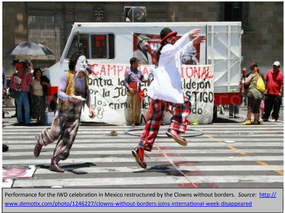
Performance for the IWD celebration in Mexico restructured by the Clowns without borders.

In Latin America, where the celebration of the IWD started, members of the Latin American Federation of Families Associ-