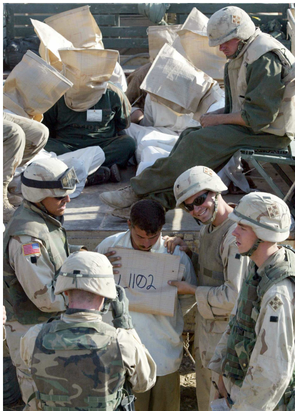
Mishahdah, Iraq: Soldiers from the US Army's 4th Infantry Division round up detainees during a July 2003 operation aimed at pro-Saddam Hussein insurgents. All of the men in the village were reportedly detained during the operation.

says, he sometimes worked at an internet café, in a two-story shopping market called al-Ghufran near the centre of town.