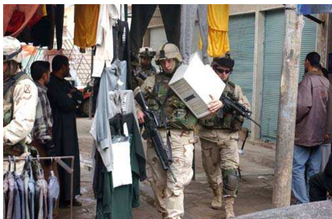
January 2004: during a raid in Fallujah, a soldier with the 346th Tactical Psychological Operations Company carries a confiscated computer from a shop